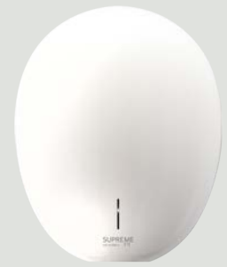
Metallic White SDB110