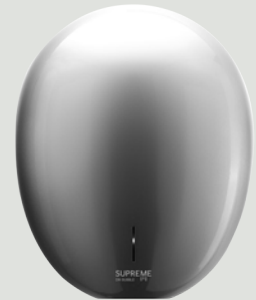
Metallic Grey SDB120