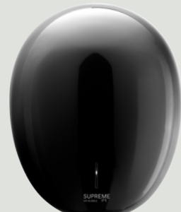
Metallic Black SDB130