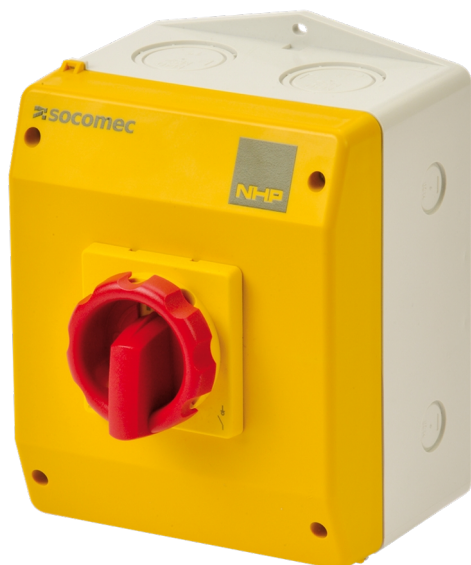
ISO Switch 63A, 3P Yellow colour Polycarbonate enclosure with Red handle