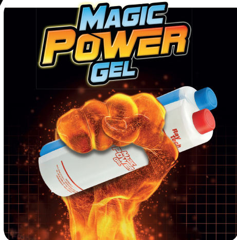
Insulating and Sealing Gel