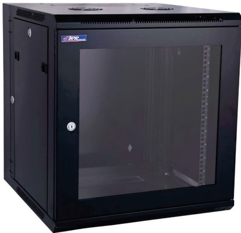
Reference image only

The WR Series wall mounted cabinets are built to the highest standards with flexibility and ease of installation at the forefront of design criteria. More than 30 different size and door variants makes the WR Series one of the most comprehensive in the market.