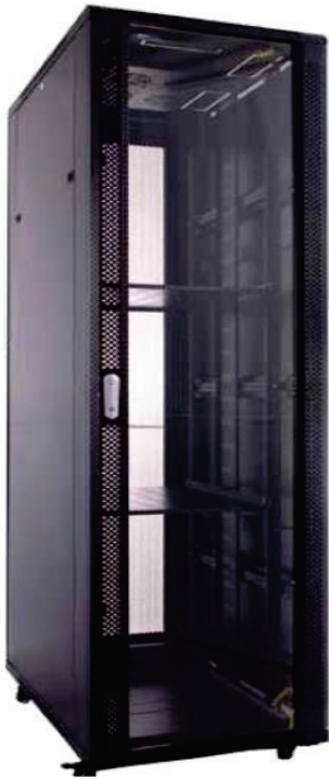
Reference image only