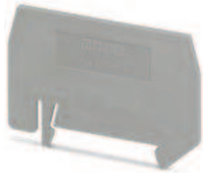
Partition plate, Length: 61 mm, Width: 2 mm, Height: 42 mm, Color: gray

Please be informed that the data shown in this PDF Document is generated from our Online Catalog. Please find the complete data in the user's documentation. Our General Terms of Use for Downloads are valid ( http://phoenixcontact.com/download )