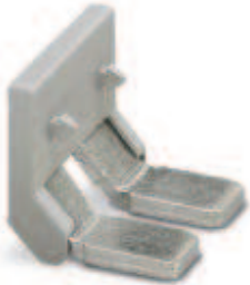
Insertion bridge, Number of positions: 2, Color: gray

Please be informed that the data shown in this PDF Document is generated from our Online Catalog. Please find the complete data in the user's documentation. Our General Terms of Use for Downloads are valid ( http://phoenixcontact.com/download )