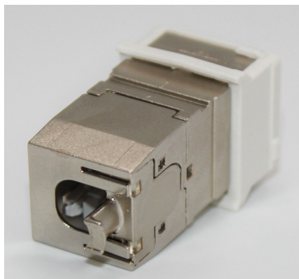
MOD-Clip Straight Entry