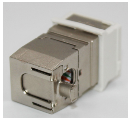
MOD-Clip Side Entry