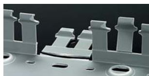
Two predetermined break lines: - for breaking off and removal of sidewall finger segments only. - for removal of sidewall finger and base segments.