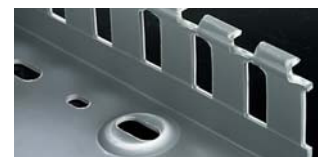
Patented recess boss for rapid mounting of components.