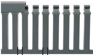
Base 15-25 x 30

It is available in a wide range of heights for space optimisation inside an electric panel.