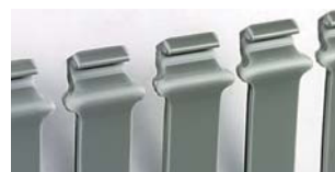
Burr-free edges for avoiding damage to the panel or electrician's hand.