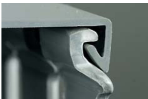
Detail of duct body/cover coupling for maximum wire retention and maximum solidity.