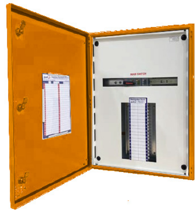
Illustration purpose only