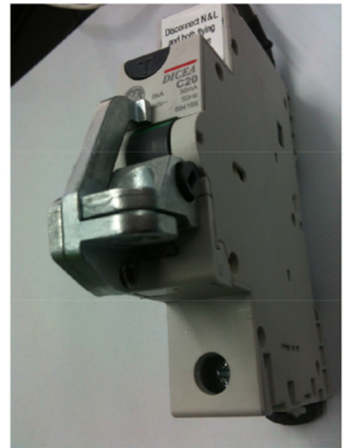
MCB Labeling still visible when fitted