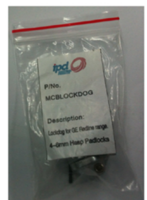
1 per Pack