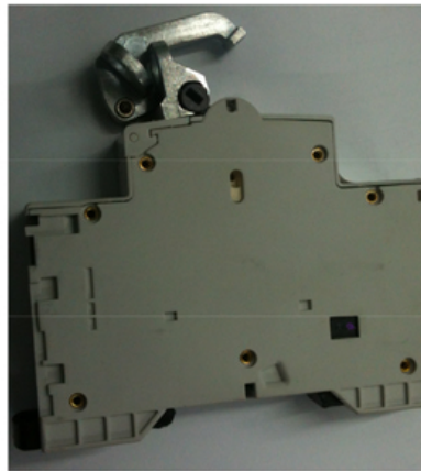
Slides on from the side