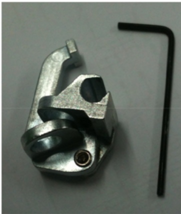
Includes Allen key