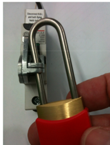
Padlock mounts sideways enabling multiple padlocking