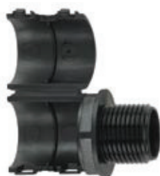
Ext Metric (Nylon)

Nylon and PP hinged, snap on fittings including locknuts.