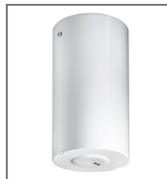
Surface mounted cylinder LIFELIGHT-PRO Diameter 127 (mm) x 252 Long

Please check our website for your closest Clevertronics office and local representative.