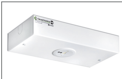
Surface mounted square LIFELIGHT-PRO LxWxH (mm): 267 x 128 x 55