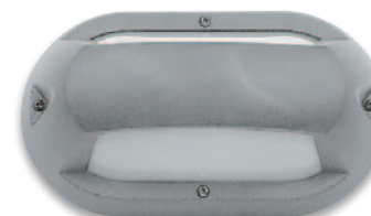
L J6004-SG (Silver/Grey)