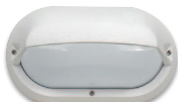
L J6003-WH (White)