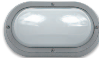
L J6001-SG (Silver/Grey)