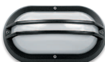
L J6002-BL (Black)