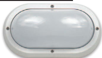
L J6001-WH (White)