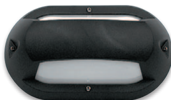
L J6004-BL (Black)