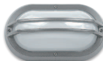
L J6002-SG (Silver/Grey)