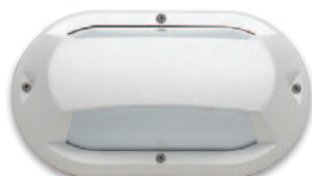
L J6004-WH (White)