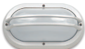
L J6002-WH (White)