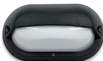
L J6003-BL (Black)