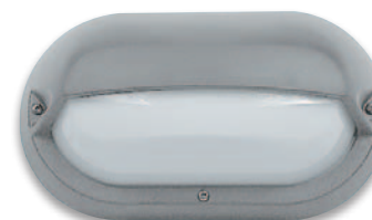
L J6003-SG (Silver/Grey)