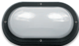
L J6001-BL (Black)