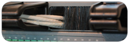
1RU Patchcord Minder