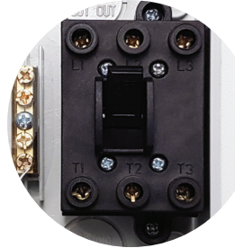
Example of internal 3-pole switch